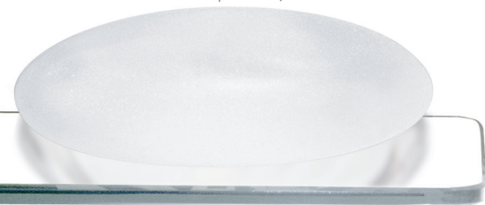
Round Moderate Profile widest base | lower profile