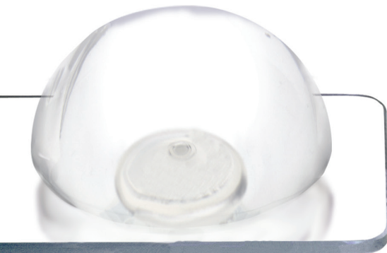
Round Ultra High Profile narrowest base | highest projection