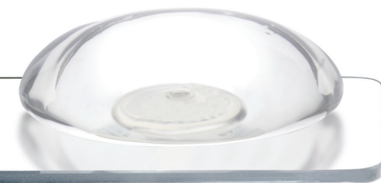
Round Moderate Plus Profile aggressive fill | moderate base | higher profile