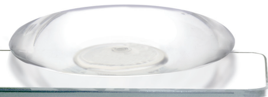
Round Low Profile wide base | lower profile