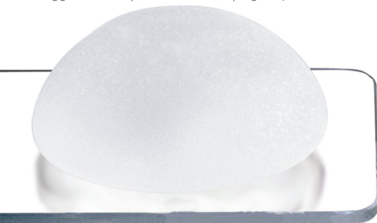
Round High Profile narrower base | higher profile