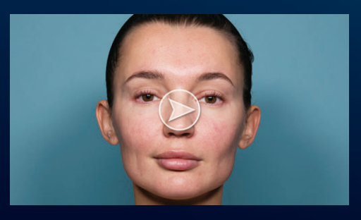
Video with LED lighting and record, playback and zoom capabilities.