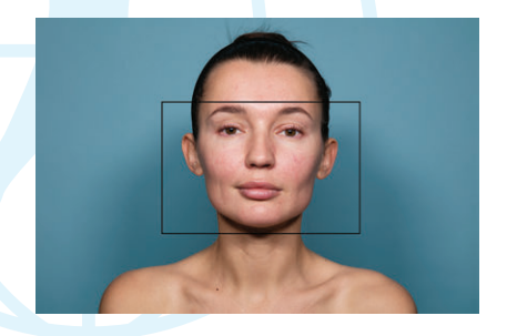
Auto facial recognition algorithms ensure that the patient's face is automatically recognized, setting the camera height for quick and repeatable patient positioning.