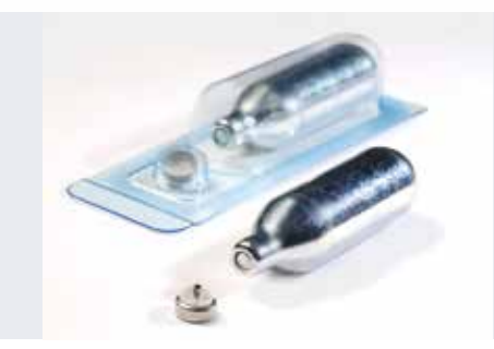
The CryoPen is the most important innovation in cryosurgery in the last decade. The combination of efficiency and practicality are unique features of the CryoPen's utility. Using the affordable CryoPen will provide you with a better treatment modality. Inexpensive disposable cartridges have a long shelf life and the operational costs of the instrument is very low with no maintenance requirements.